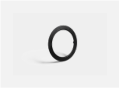
55-00001, B black ring for Ravo