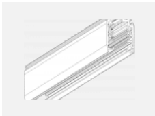
XTSC6300-3, white linear DALI track 3m, white