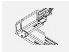
XTSC635-1, grey L-feed DALI, grey