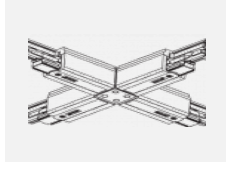
XTSC638-3, white X-feed DALI, white