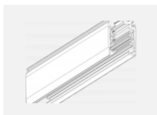
XTSC6200-3, white linear DALI track 2m, white