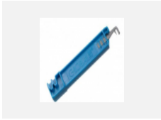
XTSV12-1, grey Bending tool for track power wires