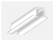
XTSCF6200-1, grey recessed linear DALI track 2m, grey