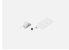
35-20101, W 2xend cap - metal, 5- conductor terminal box, grommet