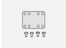
35-00200, F straight connector