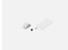
35-20101, W 2xend cap - metal, 5- conductor terminal box, grommet