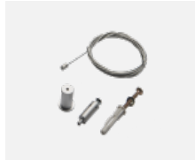
35-00300, N wire suspension 2000mm