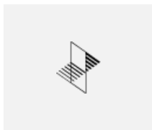
35-00111, W 2x recessed end cap long - metal, 5- conductor terminal box, grommet