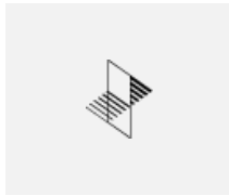
35-00111, W 2x recessed end cap long - metal, 5- conductor terminal box, grommet