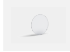
00-01100 Satinice diffuser