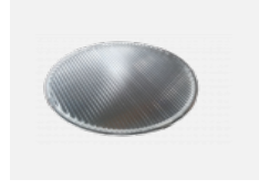
00-01101 Linear optic