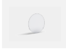
00-01100 Satinice diffuser