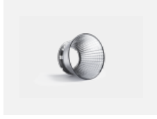
00-01002 reflector 32°