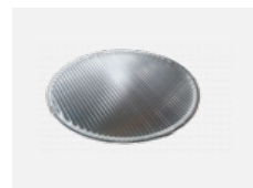
00-01101 Linear optic