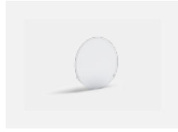
00-01100 Satinice diffuser