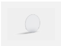
00-01100 Satinice diffuser