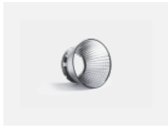
00-01002 reflector 32°