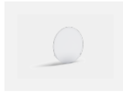
00-01100 Satinice diffuser