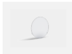
00-01100 Satinice diffuser