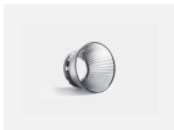
00-01002 reflector 32°