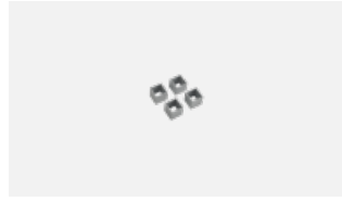
19-0009, W Mounting distance kit for square luminaire, circular 370 mm