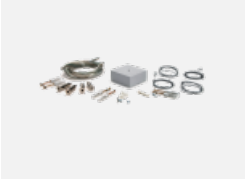
00-00333, S suspension set 2000mm, 4 pcs.of wires, cable 5x0,75mm, ceiling cup