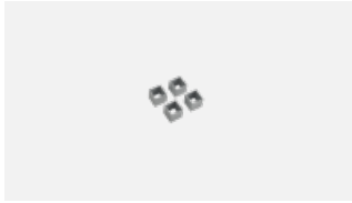
19-0009, W Mounting distance kit for square luminaire, circular 370 mm