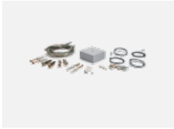
00-00333, W suspension set 2000mm, 4 pcs.of wires, cable 5x0,75mm, ceiling cup