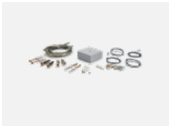
00-00333, B suspension set 2000mm, 4 pcs.of wires, cable 5x0,75mm, ceiling cup