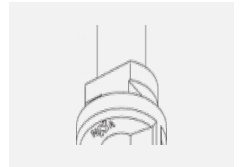
XTAK142-2, black Hook Base, black