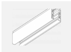
XTS4400-1, grey linear track 4m, grey