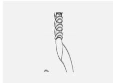
XTAK11-1, grey Hook, grey