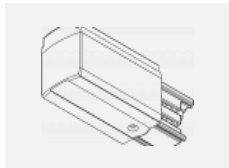
XTS11-1, grey End feed, grey