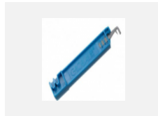
XTSV12-1, grey Bending tool for track power wires