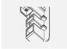
XTS41-1, grey End Cap, grey