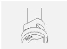
XTAK142-3, white Hook Base 2mm wire, white