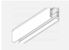
XTS4200-1, grey linear track 2m, grey