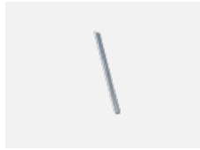
00-00363, K cable 5x1,5 2000mm