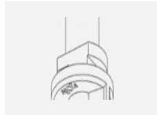
XTAK142-1, grey Hook Base, grey