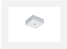
00-00370, W ceiling cup 80x80x32mm