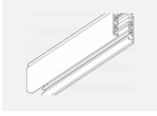
XTS4300-3, white linear track 3m, white