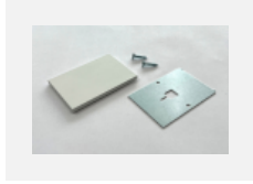
145-50102, S 2 x end cap - metal, screwless