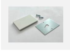
145-50102, B 2 x end cap - metal, screwless