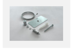
145-50303, N wire suspension for joint 2000mm - 1 pc + metal handle