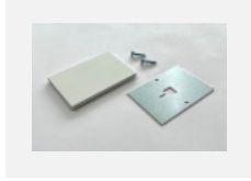
145-50102, S 2 x end cap - metal, screwless