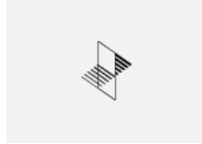
145-20700, W 2 pcs of wall fastening Lina45