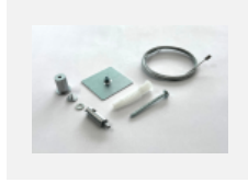
145-50301, N wire suspension 4000mm - 1 pc + metal handle