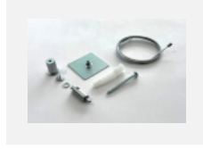
145-50302, N wire suspension 6000mm - 1 pc + metal handle