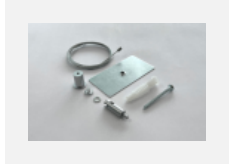
145-50305, N wire suspension for joint 6000mm - 1 pc + metal handle