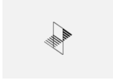
145-20700, B 2 pcs of wall fastening Lina45