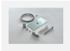
145-50304, N wire suspension for joint 4000mm - 1 pc + metal handle