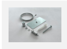
145-50305, N wire suspension for joint 6000mm - 1 pc + metal handle