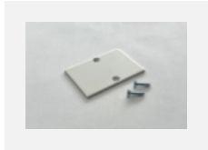
145-50101, W 2 x end cap - metal, screw