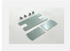
145-50200, F direct connector with caps of clearance