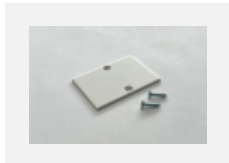
145-50101, S 2 x end cap - metal, screw