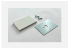
145-50102, B 2 x end cap - metal, screwless