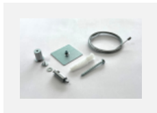
145-50302, N wire suspension 6000mm - 1 pc + metal handle