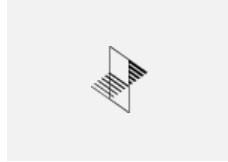
145-20700, W 2 pcs of wall fastening Lina45