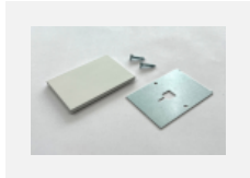
145-50102, B 2 x end cap - metal, screwless