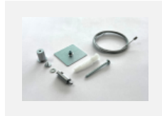
145-50300, N wire suspension 2000mm - 1 pc + metal handle