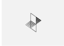
145-20700, S 2 pcs of wall fastening Lina45