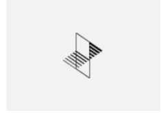
145-01200, F Accessory for gear-tray release for Lina145