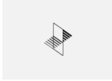
145-20700, B 2 pcs of wall fastening Lina45