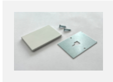
145-50102, B 2 x end cap - metal, screwless