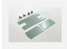
145-50200, F direct connector with caps of clearance