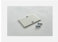
145-50101, W 2 x end cap - metal, screw