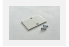
145-50101, B 2 x end cap - metal, screw