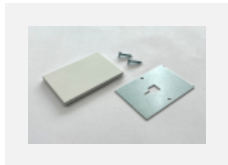
145-50102, B 2 x end cap - metal, screwless