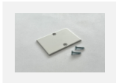
145-50101, S 2 x end cap - metal, screw