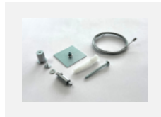
145-50300, N wire suspension 2000mm - 1 pc + metal handle