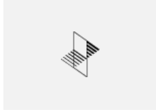
145-20700, B 2 pcs of wall fastening Lina45