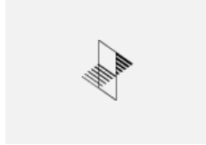
145-20700, S 2 pcs of wall fastening Lina45