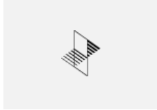
145-20700, B 2 pcs of wall fastening Lina45