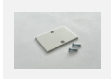
145-50101, W 2 x end cap - metal, screw