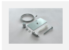
145-50303, N wire suspension for joint 2000mm - 1 pc + metal handle