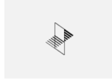
145-20700, W 2 pcs of wall fastening Lina45