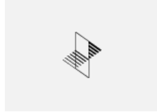
145-20700, B 2 pcs of wall fastening Lina45