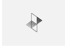
145-20700, S 2 pcs of wall fastening Lina45