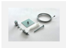
145-50302, N wire suspension 6000mm - 1 pc + metal handle