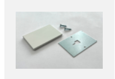
145-50102, S 2 x end cap - metal, screwless