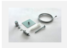
145-50301, N wire suspension 4000mm - 1 pc + metal handle