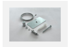
145-50303, N wire suspension for joint 2000mm - 1 pc + metal handle