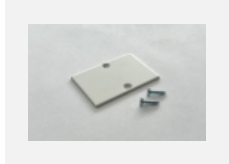
145-50101, B 2 x end cap - metal, screw