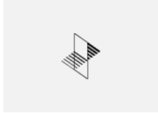
145-01200, F Accessory for gear-tray release for Lina145