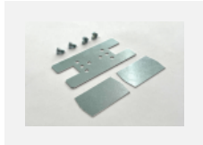
145-50200, F direct connector with caps of clearance