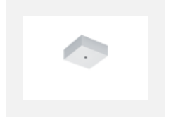
00-00370, W ceiling cup 80x80x32mm