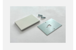
145-50102, S 2 x end cap - metal, screwless