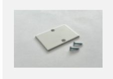
145-50101, B 2 x end cap - metal, screw