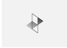
145-20700, S 2 pcs of wall fastening Lina45