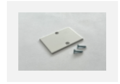
145-50101, S 2 x end cap - metal, screw