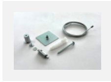
145-50300, N wire suspension 2000mm - 1 pc + metal handle