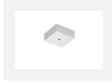
00-00370, W ceiling cup 80x80x32mm