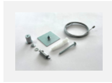
145-50302, N wire suspension 6000mm - 1 pc + metal handle