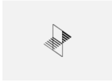
145-20700, W 2 pcs of wall fastening Lina45