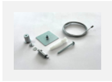
145-50300, N wire suspension 2000mm - 1 pc + metal handle