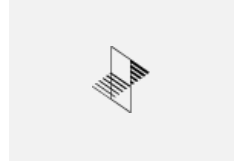
145-01200, F Accessory for gear-tray release for Lina145