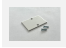
145-50101, S 2 x end cap - metal, screw