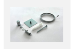
145-50301, N wire suspension 4000mm - 1 pc + metal handle