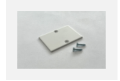
145-50101, B 2 x end cap - metal, screw