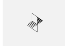
145-20700, W 2 pcs of wall fastening Lina45