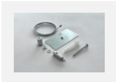
145-50304, N wire suspension for joint 4000mm - 1 pc + metal handle