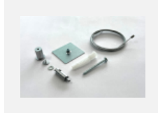
145-50301, N wire suspension 4000mm - 1 pc + metal handle