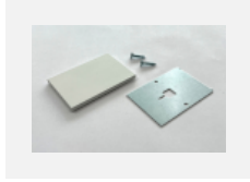
145-50102, B 2 x end cap - metal, screwless