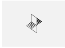
145-01200, F Accessory for gear-tray release for Lina145