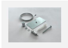
145-50305, N wire suspension for joint 6000mm - 1 pc + metal handle