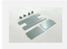
145-50200, F direct connector with caps of clearance